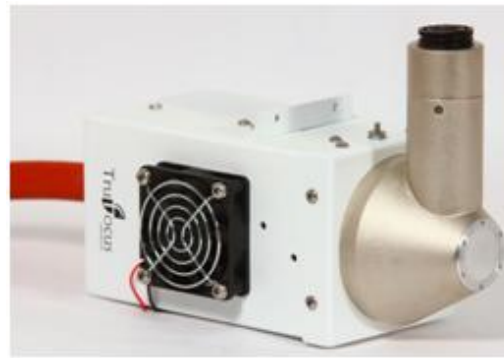
Packaged in a metal housing with FAN