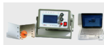
PC Control Mode Use a PC & MAX Controller to control MAX-UNI-S-8-2-10-W-W