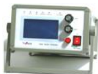
MAX Series Controller (MAX Controller)

Controller with Color LCD • Graphic User Interface • PC USB Interface • PC Software Driver with advanced control & detection functions • Fiber Optics/USB Interfacing for Noise Free Communication