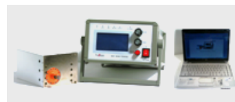
PC Control Mode Use a PC & MAX Controller to control MAX-UNI-L-6-2-10-W-W