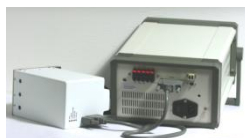
Front Panel Control Mode Use MAX Series Controller to control MAX-UNI-L-6-2-10-W-W